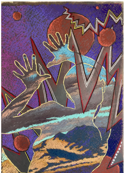
Crossroad , soft pastel, 24" x 36", 2021

The work is striking. Heavily silhouetted, featureless bodies assume dramatic poses that take up most of the composition space. The rough fabric of Teske's frenetic tickmarks have been replaced by slower, steadier lines and backgrounds have gone mostly dark and geometric.