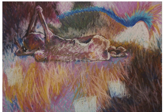
Blue Eyes , soft pastel, 18" x 24", 1995

Since most of Teske's figures exist inside these ambiguously supernatural spaces, a small pastel, titled Blue Eyes , stands out for its portrayal of a real man in a real room. Made in 1995, the small drawing centers on an emaciated figure who is curled up on a bed and turned away from the viewer. All around the person — who Teske confirms is her father — colorful and wild lines scribble across the page like a leaking aura, shooting pinks, yellows, and blues convulsively into a black background. The colors are too volatile and the lines too erratic for the viewer to visually stitch them back together. The body is too far gone to live in the world of