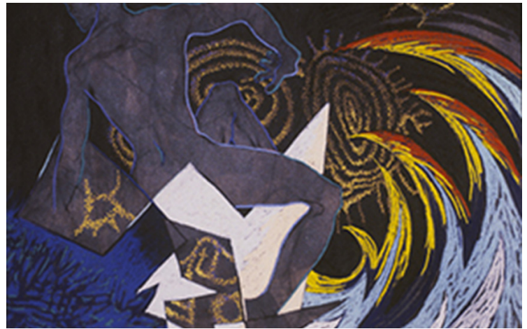
Cosmic Surfer , soft pastel, 36"x54", 1999

In the background, a pattern resembling a primitive pictograph wallpaperers the edges of the universe as sharp planes of white glitch in and out. In the corner, a collection of quick, purple tickmarks glow against a dark void, resembling a stand of high desert scrub at night or a tear in the fabric of space-time. On the other side of the drawing, I imagine the landscape goes on and on, each mark barely holding back the cosmos.