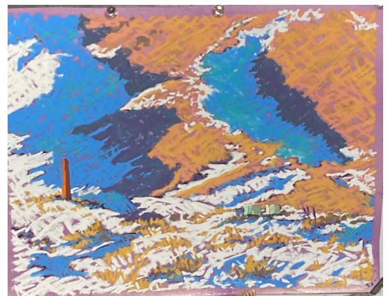
Winter Light , soft pastel, 12”x15”, 2022

Winter Light captures a snowy image that could be mistaken for a pair of sunken footprints if it weren’t for several brown, vertical marks in the left corner that hint at a structure. Teske identifies these marks as a water tank and I place the artist further back than I originally thought — on a hill or a mountain — overlooking a broad, beveled landscape with icy blue shadows and straw-colored hills embroidered with snow. Similar to the